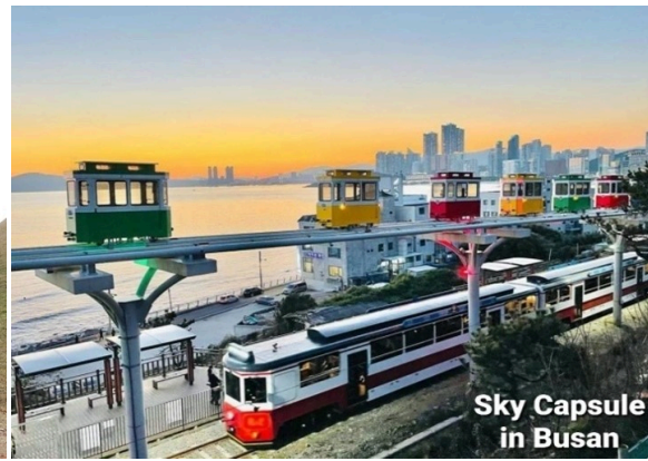
Sky Capsule in Busan

Day 9 UNESCO GYEONGJU CITY We visit Tombs of Silla Kings in Royal Tumuli Park - the Daereungwon Tomb Complex and Cheomseongdae, an ancient astronomical observatory. Cheomseongdae (built 647 AD) means star-gazing tower and is the oldest surviving astronomical observatory in Asia. Then we hop into local buses to visit the UNESCO-listed Bulguksa Temple , follow by Gyeongju National Museum to learn more about the city's ancient past, and then Woljeonggyo Bridge , which built during the Unified Silla period (AD 676-935), but was burnt down and rebuilt in 2018 to become the largest wooden bridge in Korea. ON Gyeongju.