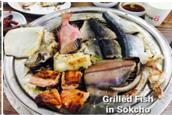
Grilled Fish in Sokcho

Day 5 SOKCHO (EAST COAST) Morning is Free & Easy, then we check-out and re-group before noon to bus 2.5 hours to Sokcho, which is a coastal town by the East Sea (or Sea of Japan) and gateway to nearby Seoraksan National Park. This pleasant fishing town is well known for its raw-fish eateries. We take leisure walk around the nearby lake, dinner at local joint, pack some food and rest early for tomorrow mini hike. ON Sokcho.