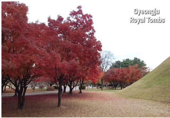
Gyeongju Royal Tombs