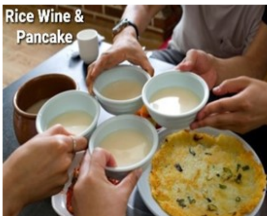
Rice Wine & Pancake

Day 10 BUSAN FISH MARKET & GAMCHEON VILLAGE Early morning 1 hour bus to Busan city, and further 40mins of subway to our Hotel in Nampo area, which is the central commercial and shopping area in Busan. Once settled our luggage at hotel, we visit the Fish Market of Jagalchi (Korea's largest seafood market) and sample some typical local lunch nearby. With short bus ride, our next stop is Gamcheon Culture Village . The area is known for its steep streets, twisting alleys, and brightly painted houses, which have been restored and enhanced in recent years to attract tourism. Later, if time permit, to visit Songdo area where one can enjoy the Cable Car ride over the ocean, or simply stroll along the Skywalk, i.e. features sections with a clear glass floor that create the feeling of walking on top of the ocean. On the way back to hotel, we visit BIFF square - a "Star Street" dedicated to film, related to the world-famous Busan International Film Festival. And spot the hand printings (cemented on the street) of famous movie celebrities include Zhang Yimou, Oliver Stone and Kitano Takeshi. ON Busan.